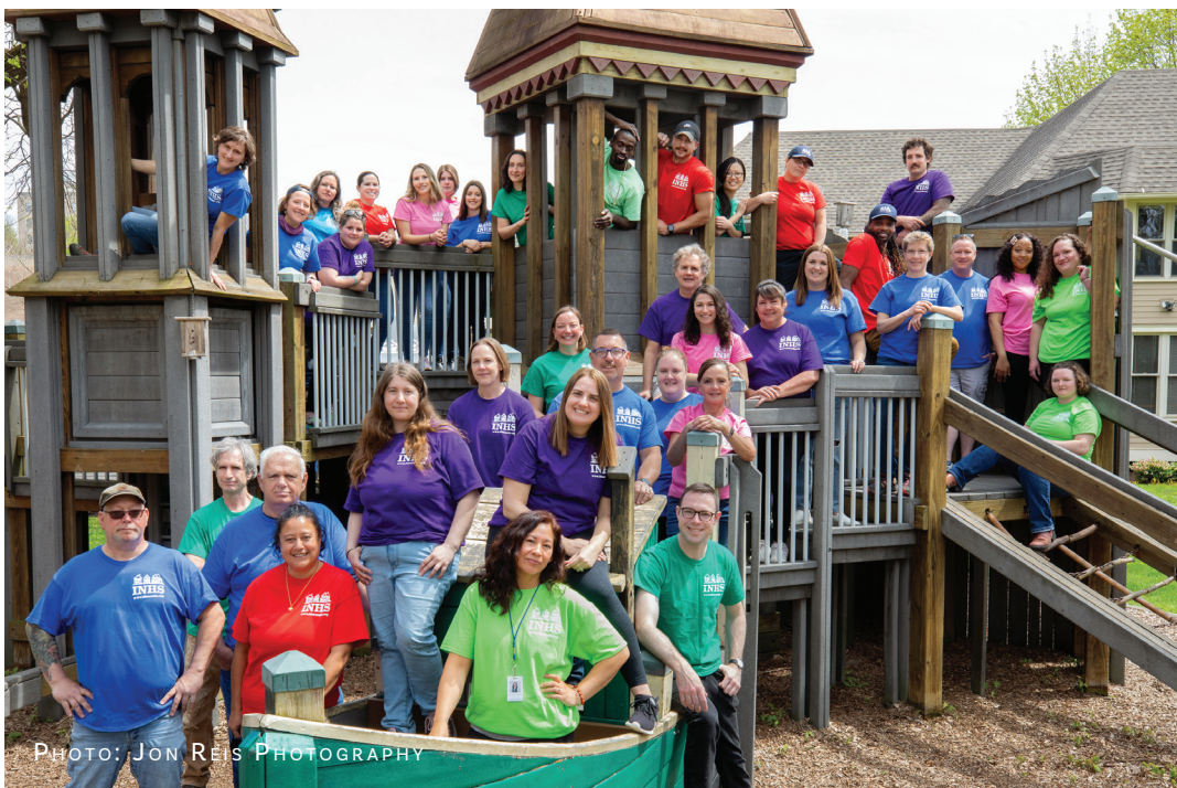
In May 2022, INHS staff gathered for its first in-person meeting in more than two years!