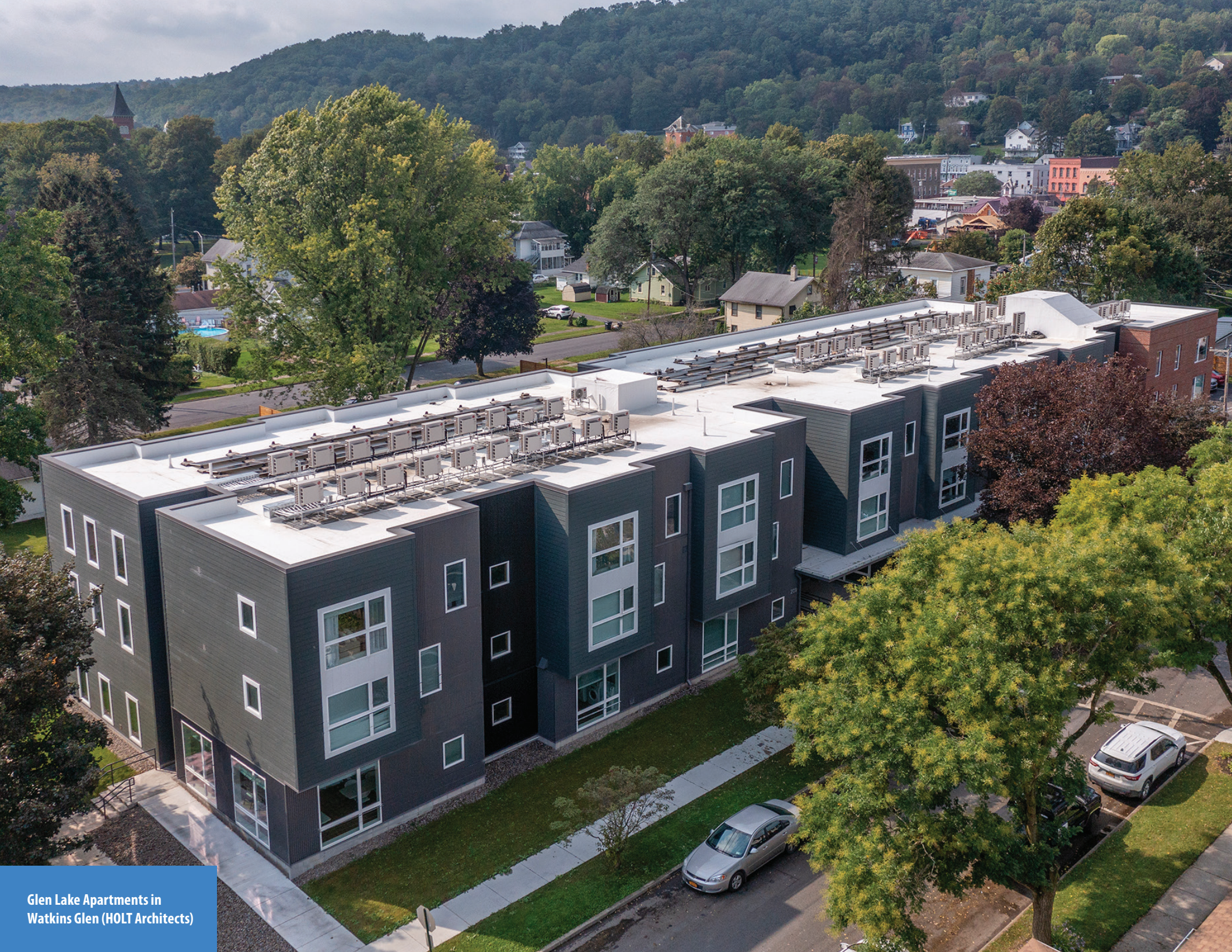
Glen Lake Apartments in Watkins Glen (HOLT Architects)