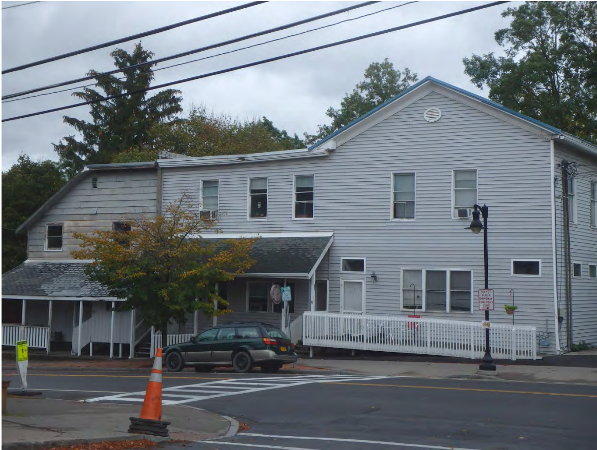
Mixed Use Building, Main Street