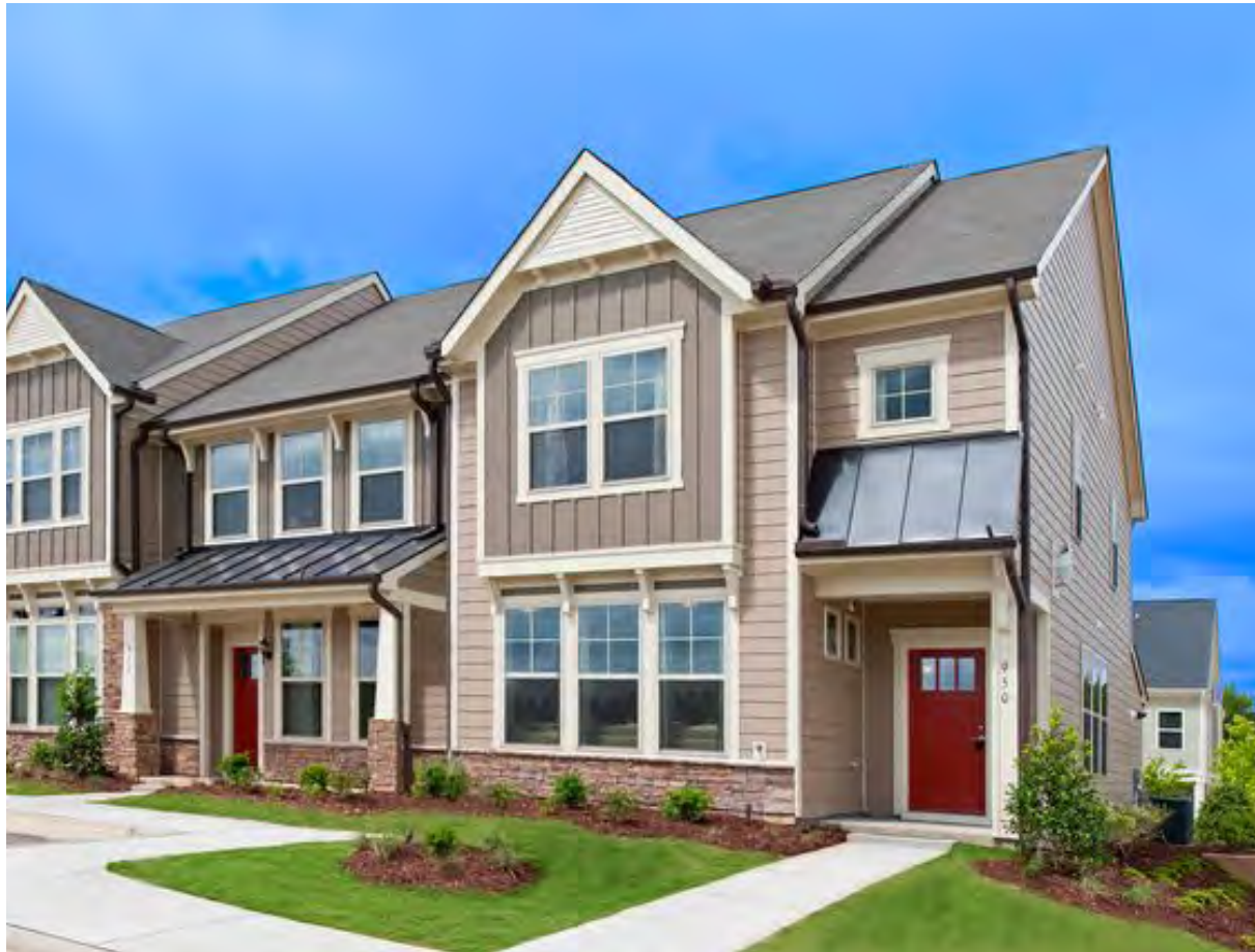
2 Story Multifamily