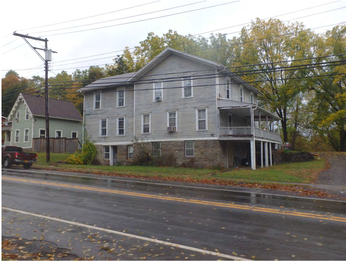
Multifamily rental, Main Street