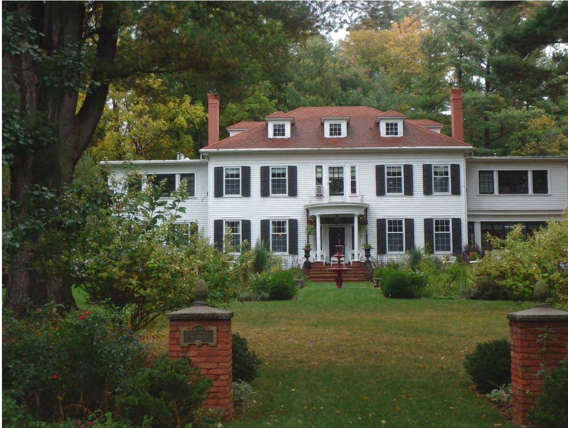
Juniper Hill Bed and Breakfast