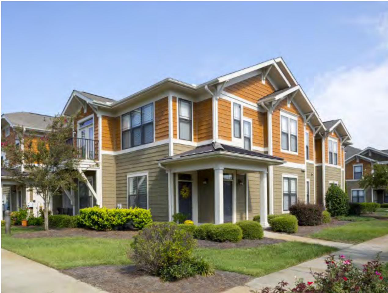
2 Story Multifamily