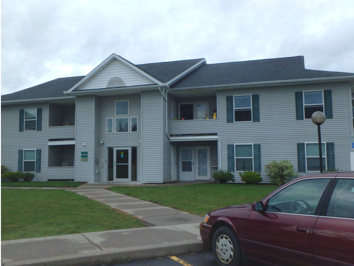
Multifamily rental, Parkside Vista