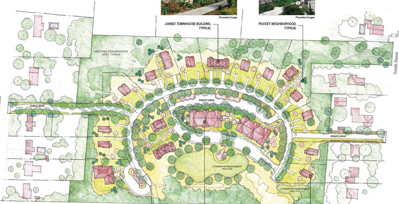
POCKET NEIGHBORHOOD, TYPICAL