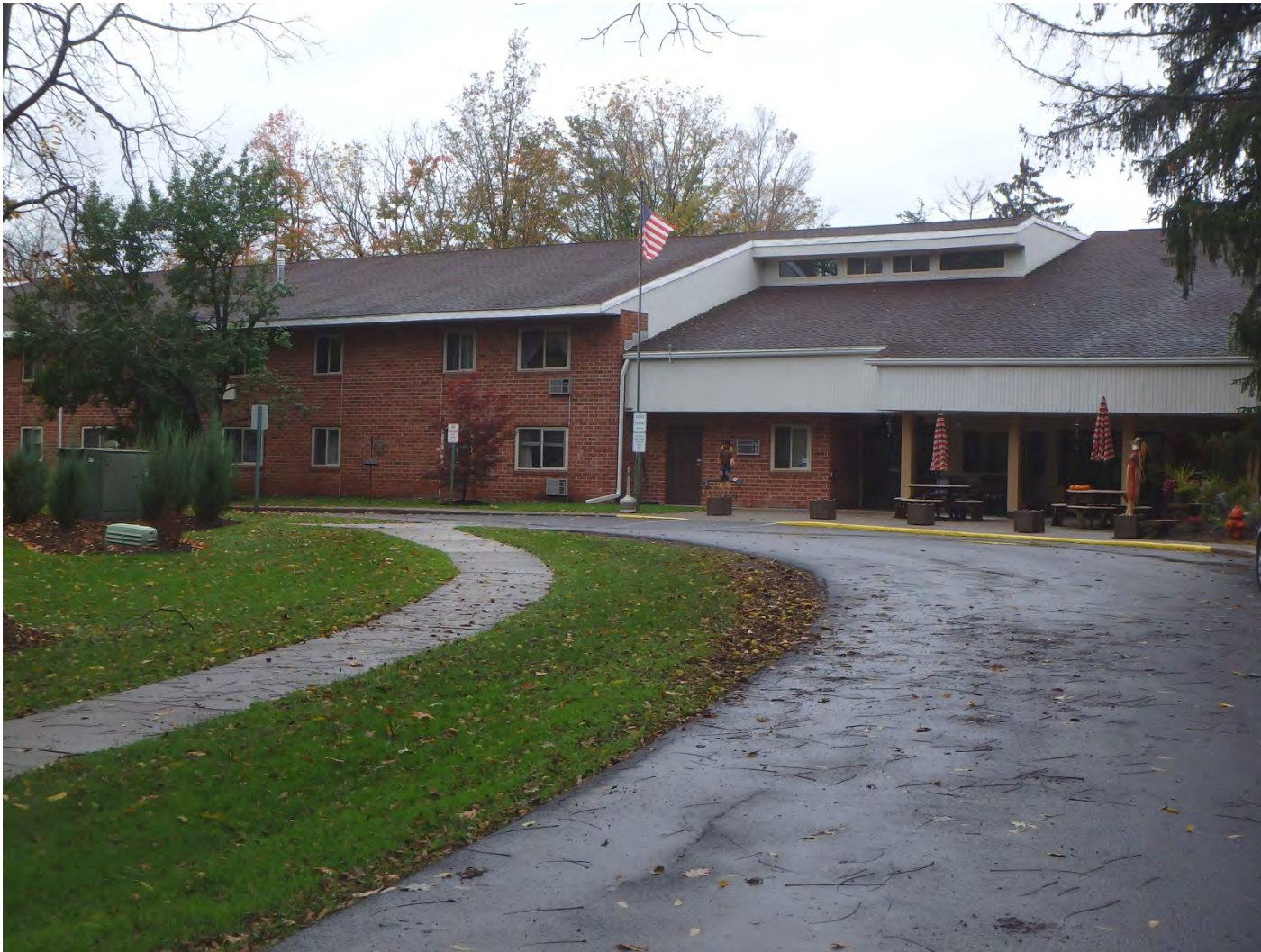
Juniper Manor I, 40 units