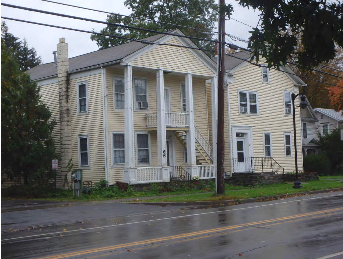
Multifamily rental, Main Street