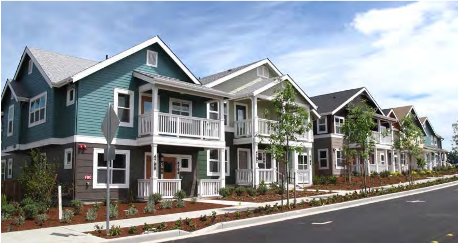
2 Story Multifamily