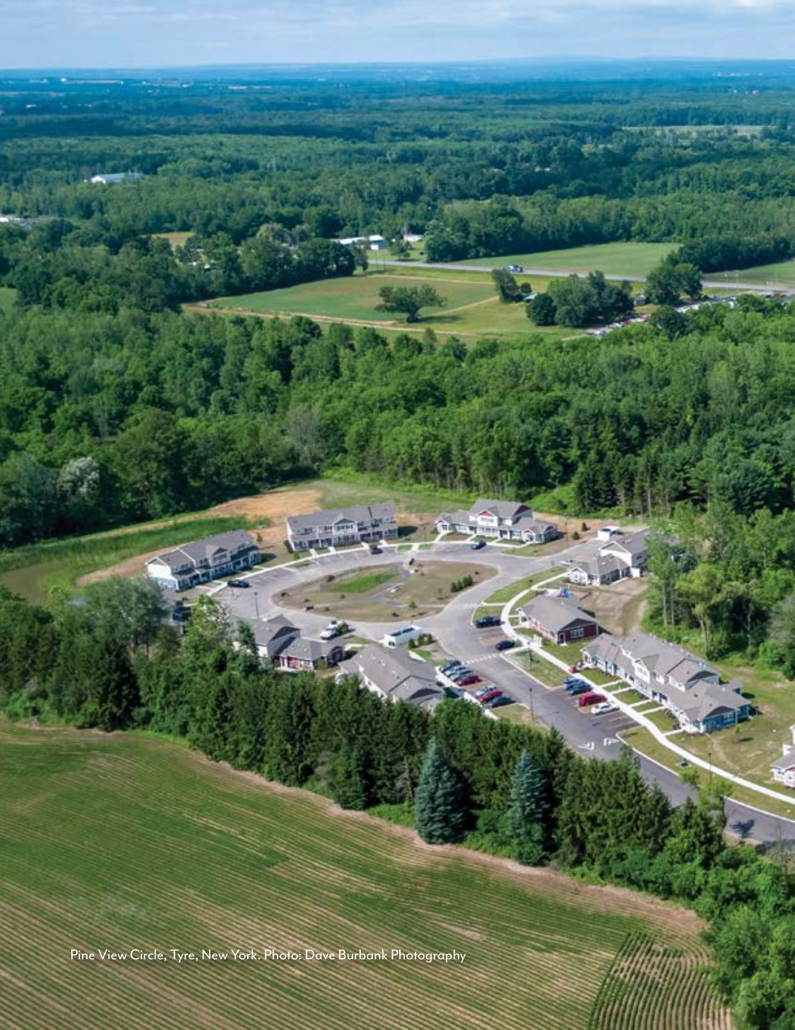
Pine View Circle, Tyre, New York.